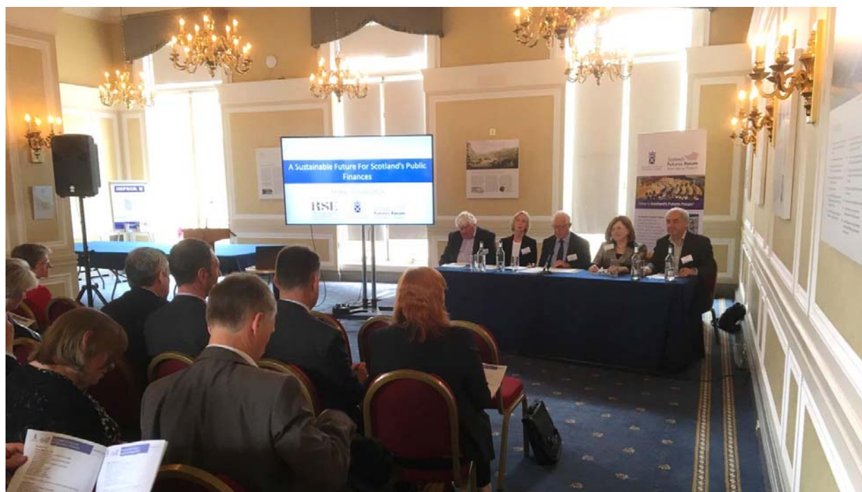
A Sustainable Future for Scotland's Public Finances, 15 June 2018, at the Royal Society of Edinburgh