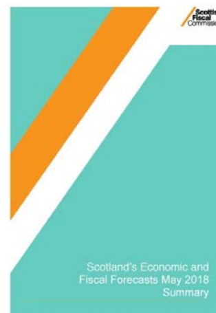
SFC Forecasts - May 2018